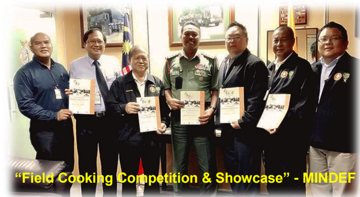
"Field Cooking Competition & Showcase" - MINDEF

Email us at secretariat@asiafoodfestival.com.my