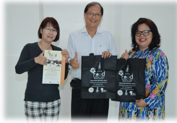
Penang Tourist Guide Association (PTGA) and Malaysian Association of Hotels, Penang Chapter