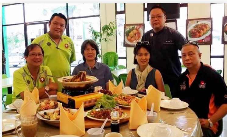
Wine & Spirit Conference by Foodcult Pte Ltd