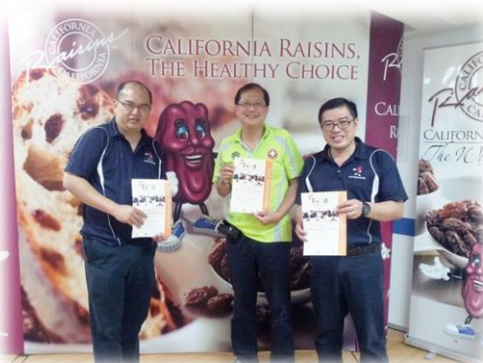
California Raisins & US Potato Board

For more information and continuous updates of AFF 2014, please visit our websites at