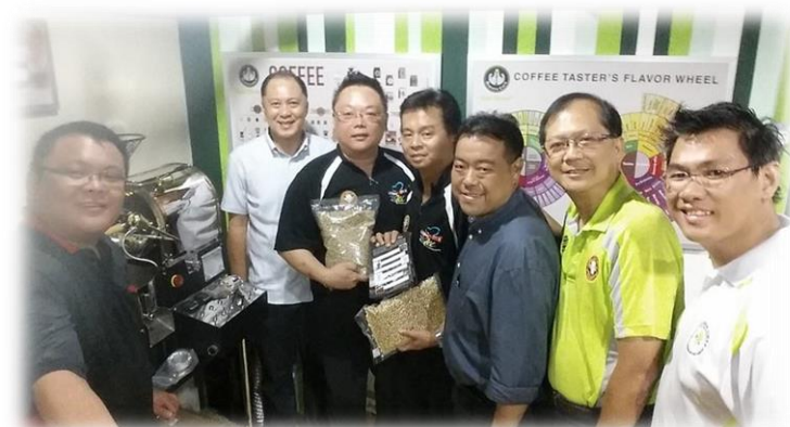
Asian Barista Championship - GC Barista Academy