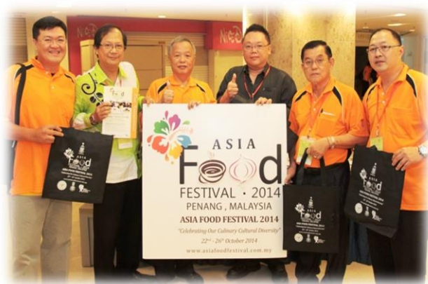
Pan Malaysia Koo Soo Restaurant & Chefs Association & Penang Chinese Chefs Association