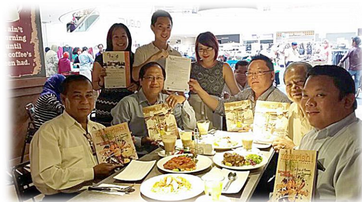
AFF Official Magazine - Nourish