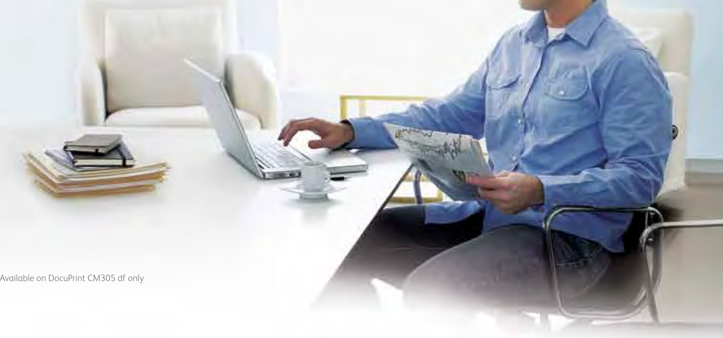
*Available on DocuPrint CM305 df only

In addition, with Secure Print and Secure Fax Receive, you can set password protection on prints and faxes*. This way, the DocuPrint C305 Series will only print the protected job when you key in the password, thereby keeping sensitive data safer.