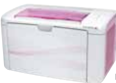
Pink (limited edition)