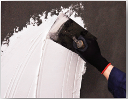
Spread at 1-2 mm per layer each time.