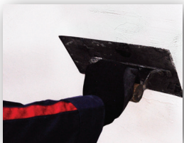
Level, compact and smoothen the plastering mortar with steel trowel.