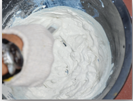
Mix Ezi PLASTER FINISH with clean water as per recommended ratio.