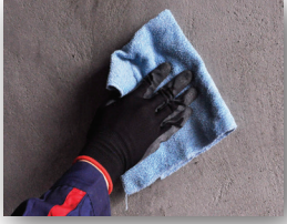
Ensure the substrate is dry, flat and free of contaminants.