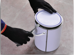
Use directly from the container.