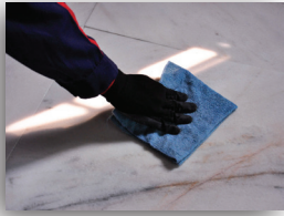
Ensure the substrate to be treated is free of contaminants.