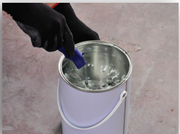
Stir well the sealer before use.