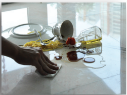
It achieves "Touch Dry" within 2 to 4 hours while its water repellent properties progressively develop within 24 hours. Attainment of maximum properties in 5 days.