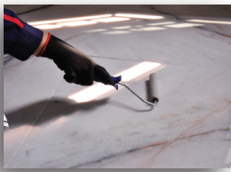
Apply Ezi PREMIUM 1 SEAL to the top surface of natural stones with a brush or roller.