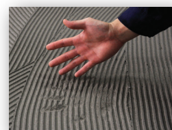
Adhesive bed is no longer sticky - "Skin-Over"