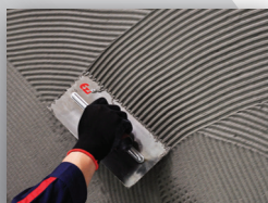
Spread paste on the substrate