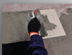
Spread paste on the back of tile