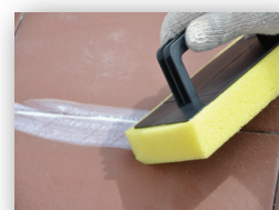
Applying the grout

Note: Unfavourable weather conditions (e.g. extremely hot, strong wind, high temperature, etc.) or highly absorbent substrate can drastically reduce the open time.