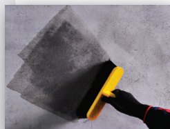
Make sure the surface is clean