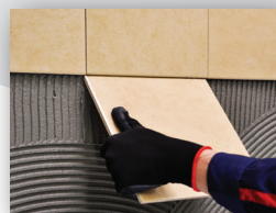
Place tile onto the adhesive bed

- Spread no more than 1 m 2 at a time to prevent Skin-Over. In normal ambient temperature and humidity conditions, the open time of Ezi STAR FIX is approximately 15 minutes.