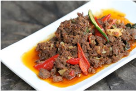
S11 Pakapau Beef (with Basil Leave) RM23.80(M) RM32.80(L)