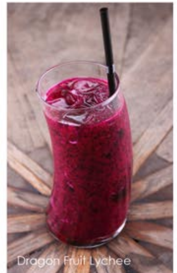
Dragon Fruit Lychee