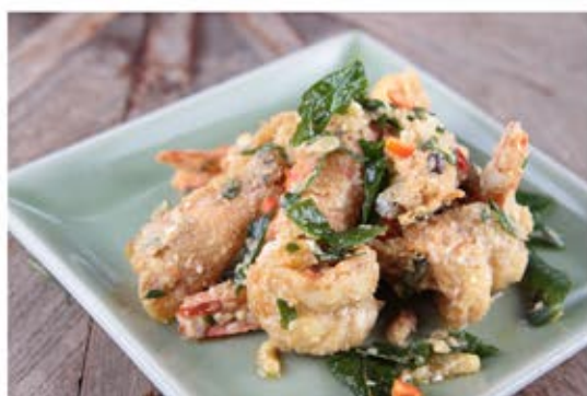
N12 Prawn with Salted Egg