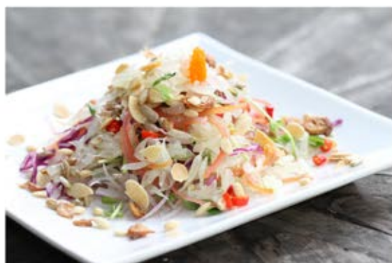
D10 Pomelo Salad RM22.80(M) RM28.80(L)