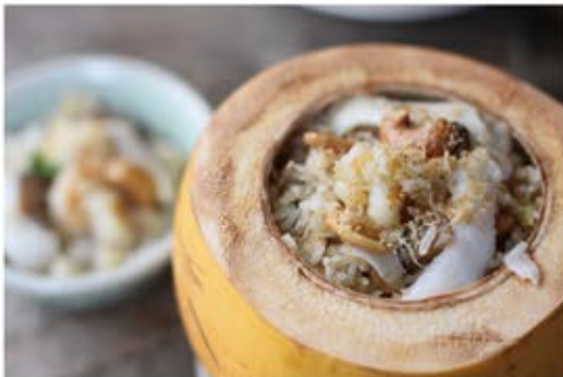
A1 Fragrant Coconut Rice RM15.80