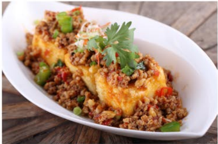
G5 Tofu Minced Chicken with Chili Bean Sauce RM19.80(M) RM26.80(L)