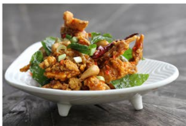
M11 Soft Shell Crab with Cashewnut RM42.80(M) RM52.80(L)