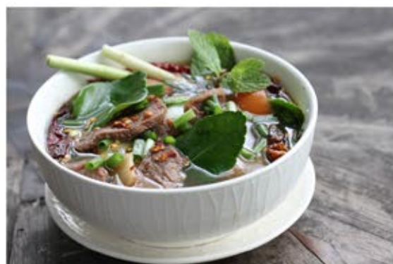
C8 Loatian Spicy Tom Siap Beef Soup RM26.80(S) RM38.80(M) RM58.80(L)