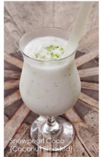
Snowpearl Coco (Coconut Blended)