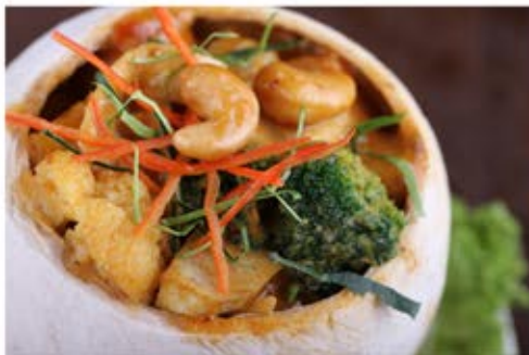
VP1 Vegetarian Otak-otak in Fresh Coconut RM22.80