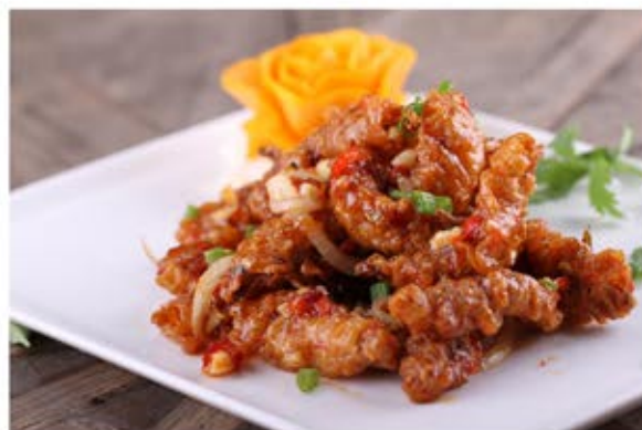
K7 Sweet and Sour Mantis Prawn RM22.80(M) RM32.80(L)