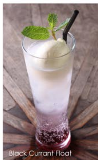
Black Currant Float