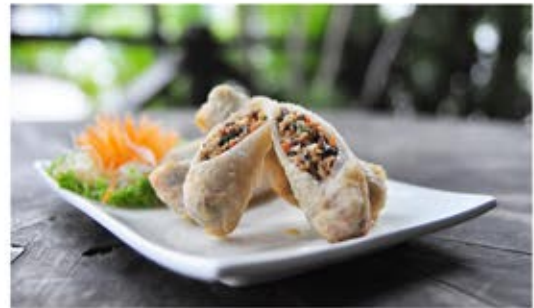
B3 Deep Fried Vietnamese Spring Roll RM12.80(4 pcs) RM18.80(6 pcs)