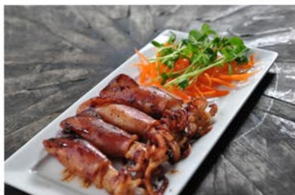
K6 Grilled Squid RM22.80(M) RM32.80(L)