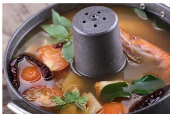
C2 Clear Tom Yam Seafood Soup RM26.80(S) RM38.80(M) RM58.80(L)