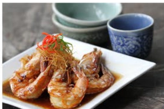
N1 Garlic Soya Sauce Prawn