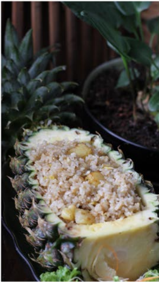
A2 Pineapple Fried Fried Rice RM15.80