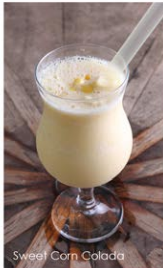
Sweet Corn Colada