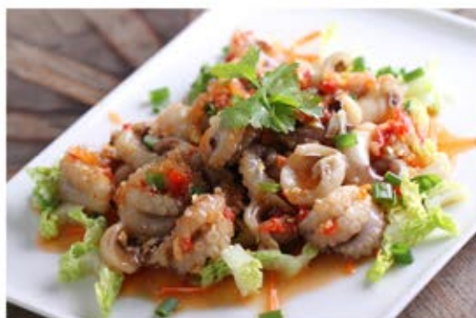
D5 Baby Octopus/Squid Salad RM22.80(M) RM28.80(L)