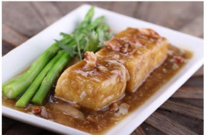
G3 Crab Meat Tofu RM22.80(M) RM31.80(L)