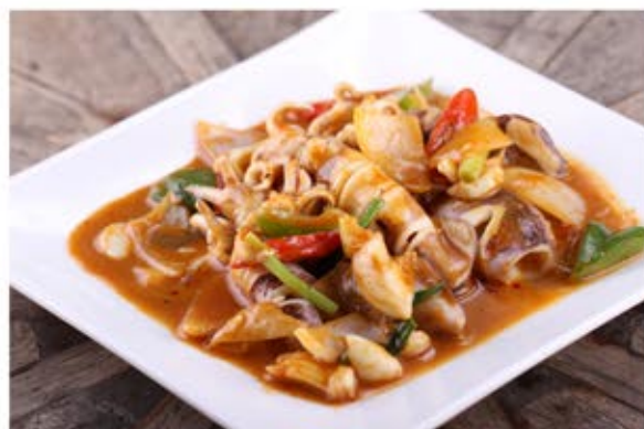
K2 Squid in Spicy Thai Sauce RM22.80(M) RM32.80(L)