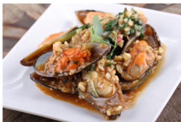
P6 Mussel with basil leaves RM22.80(M) RM32.80(L)