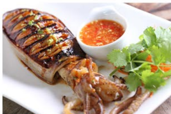
K5 Thai Style Grilled Octopus RM22.80(M) RM32.80(L)