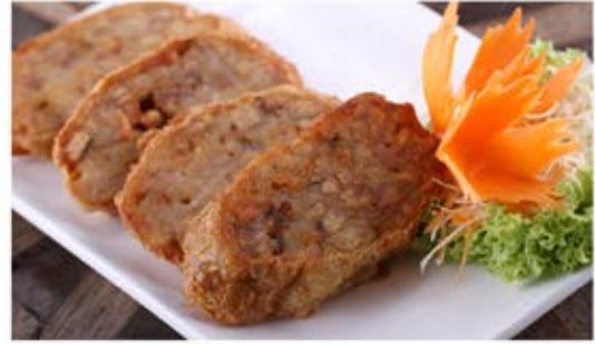
B8 Yam Cake RM12.80(4 pcs) RM18.80(6 pcs)