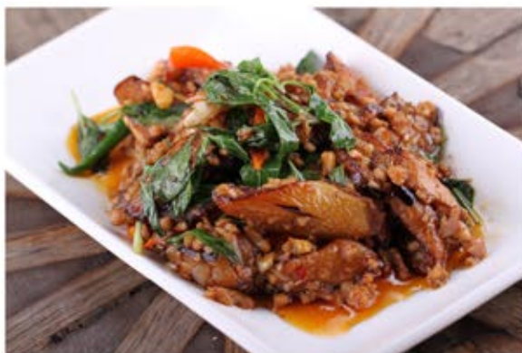
E16 Egg Plant Basil Leave RM18.80(M) RM24.80(L)