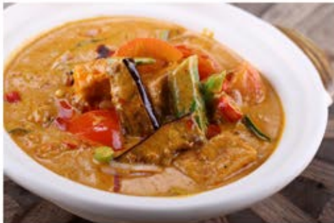
VL10 Claypot Vegetable Curry RM28.80(M) RM38.80(L)