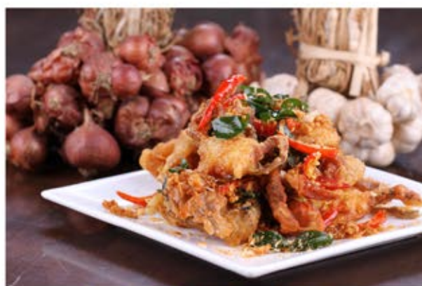
M13 Fried Soft Shell Crab with Fragrant Shredded Coconut RM42.80(M) RM52.80(L)