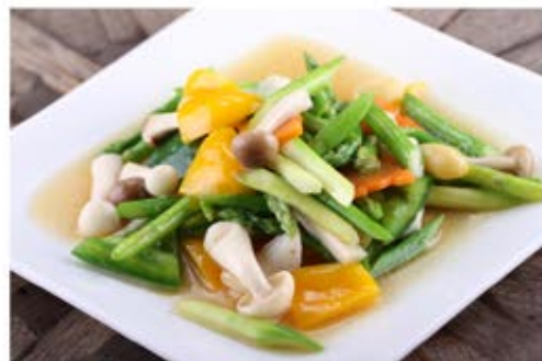
VE18 Asparagus, Lily bulb Gingo Nuts RM18.80(M) RM26.80(L)