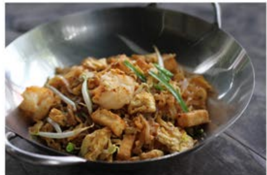
A23 Phat Thai (Thai Noodles) RM14.80