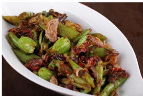
E17 Four Vegetable Sambal RM18.80(M) RM24.80(L)