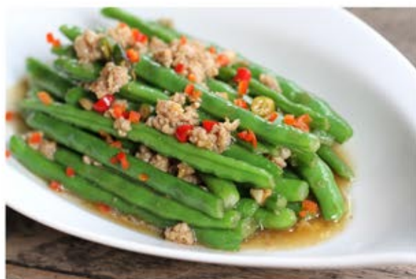
E22 French Bean Minced Chicken RM18.80(M) RM24.80(L)