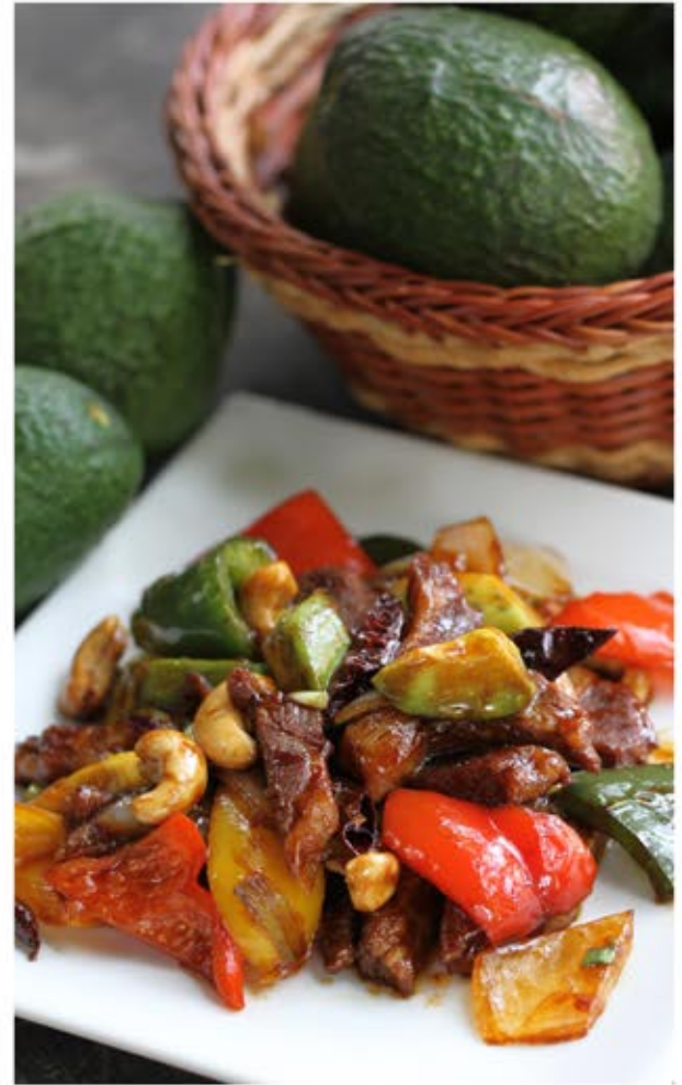
S1 Green Curry Beef RM24.80(M) RM34.80(L)