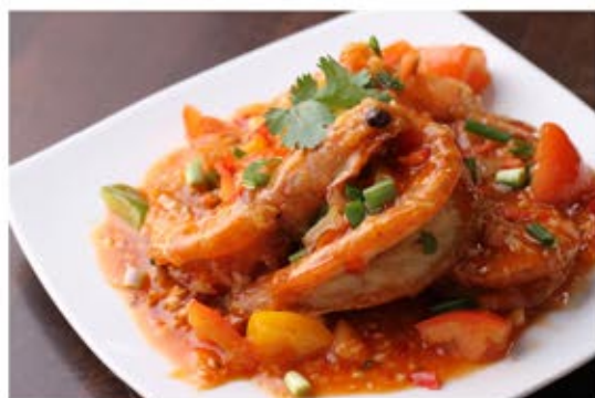
N7 Three Flavoured Prawn