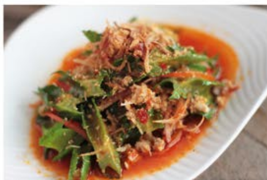
D15 Wing Bean Salad RM18.80(M) RM26.80(L)