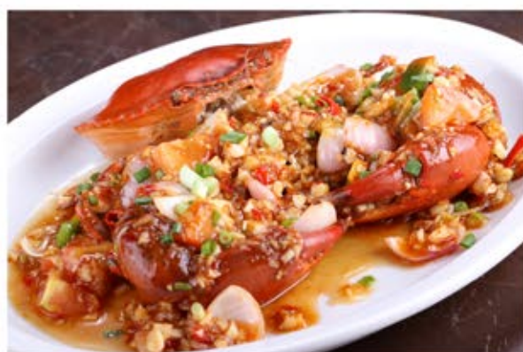
M3 Three Flavoured Crab

M1 Curry Powdered Crab (Non Spicy Thick Curry)