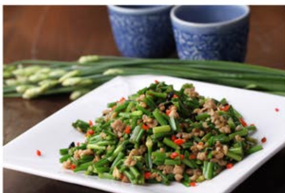
E11 Chinese Leeks with Minced Chicken & Fermented Bean RM19.80(M) RM26.80(L)