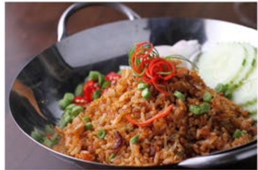
A6 Spicy Nam prik Fried Rice RM14.80