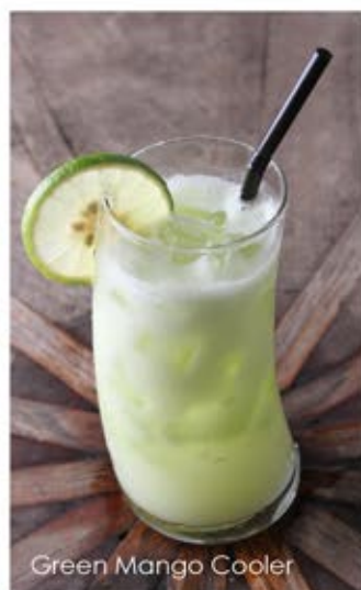
Green Mango Cooler