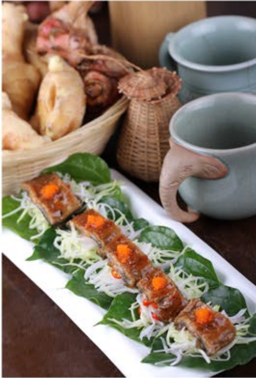
B2 Unagi Mango Canape RM18.80(6 pcs) RM28.80(10 pcs)