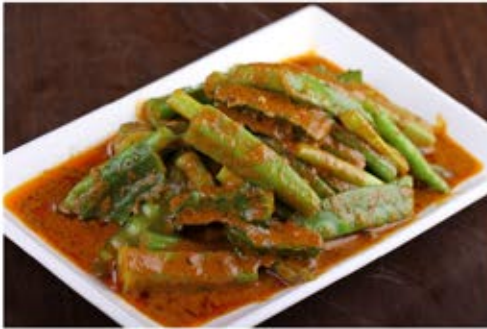
VN13 Dried Indochine Curry Veggie RM18.80(M) RM24.80(L)