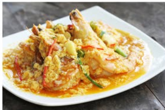
N2 Thai Curry Powdered Prawn