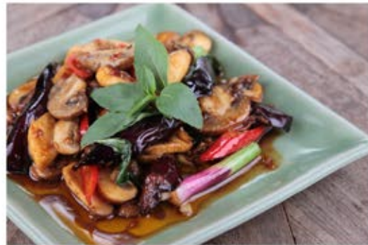
VE12 Fresh Mushroom Basil Leaf RM18.80(M) RM24.80(L)