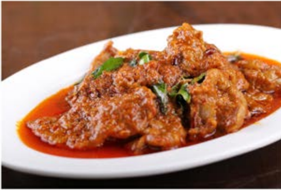
S13 Indochine Curry Lamb RM25.80(M) RM34.80(L)