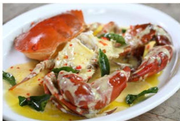
M10 Butter Cheese Crab