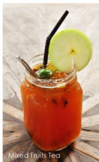
Mixed Fruits Tea