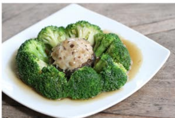
E23 Stuff Mushroom & Broccoli RM19.80(M) RM26.80(L)