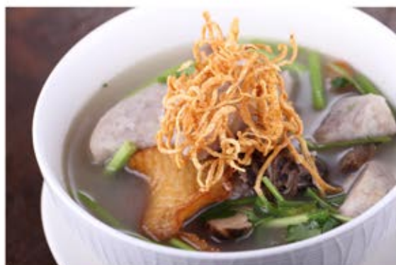
C10 Seafood Yam Soup RM26.80(S) RM38.80(M) RM58.80(L)