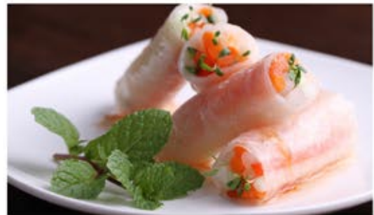
B4 Vietnamese Fresh Vegetables Spring Roll RM12.80(4pcs) RM18.80(6pcs)