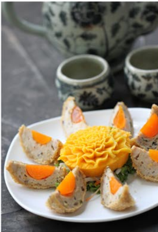
B11 Deep Fried Amazing Egg RM14.80(M) RM21.80(L)