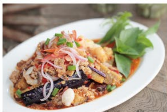
D13 Egg Plant Salad RM18.80(M) RM26.80(L)