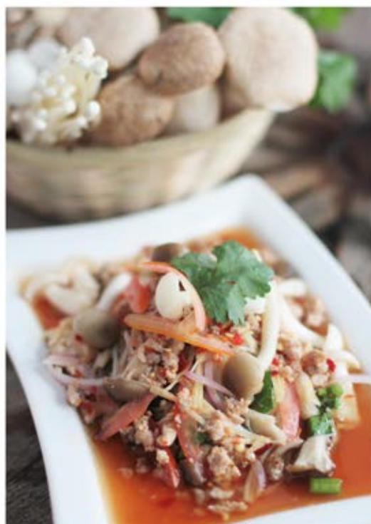
D19 Fresh Mushroom Salad RM18.80(M) RM26.80(L)