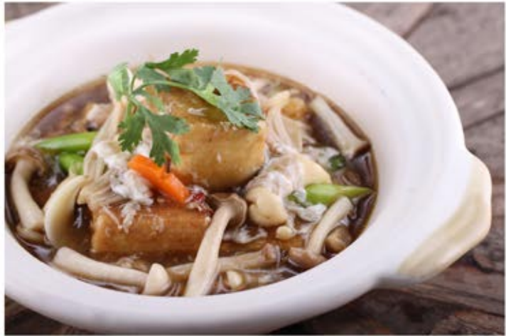
G2 Claypot Tofu RM22.80(M) RM31.80(L)