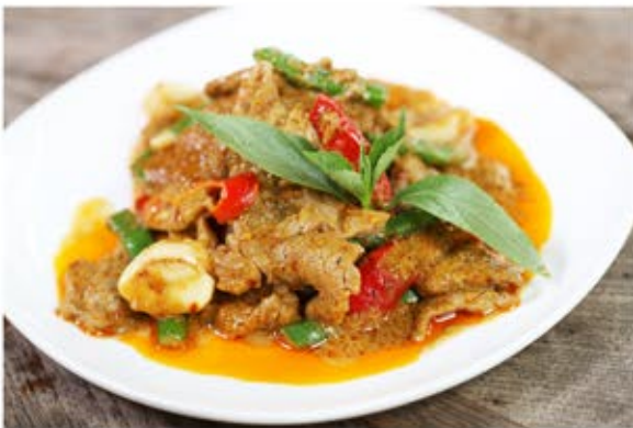
S3 Papet Beef (without curry powder) RM23.80(M) RM32.80(L)