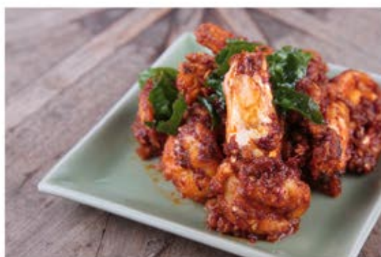
N15 Thai Sambal Prawn