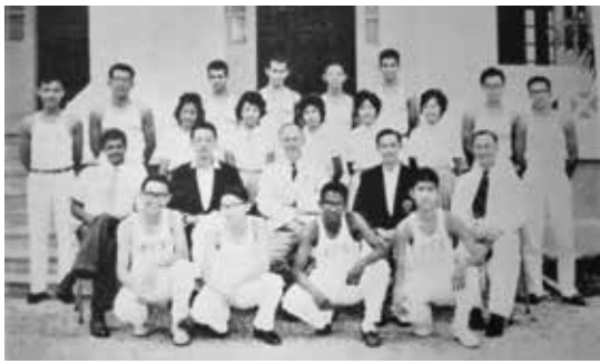
1961 PFS RELAY TEAMS