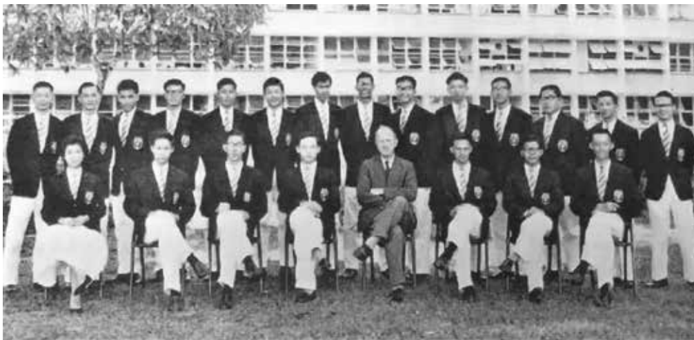
1960 PFS SCHOOL PREFECT BOARD