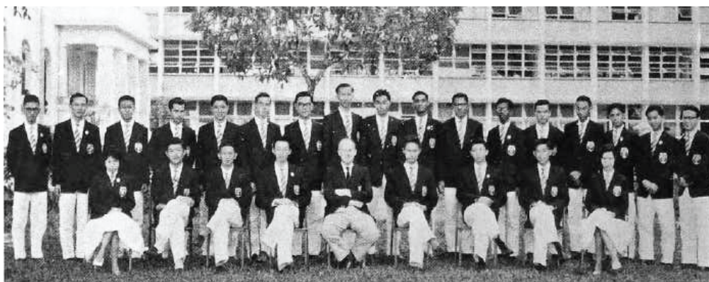
1961 PFS SCHOOL PREFECT BOARD