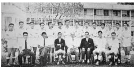
1961 PFS RUGBY FOOTBALL TEAM