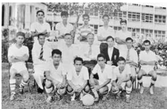
1960 PFS FOOTBALL TEAM