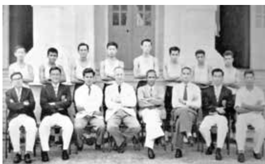
1959 PFS SCHOOL ATHLETICS TEAM