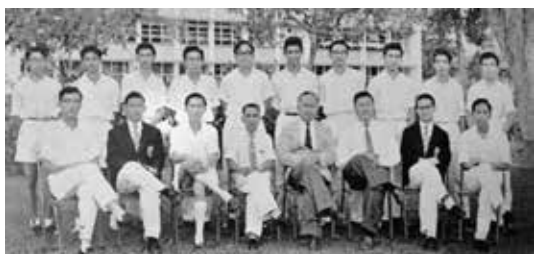
1961 PINHORN HOUSE COUNCIL