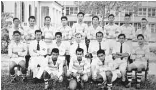
1958 PFS RUGGER TEAM