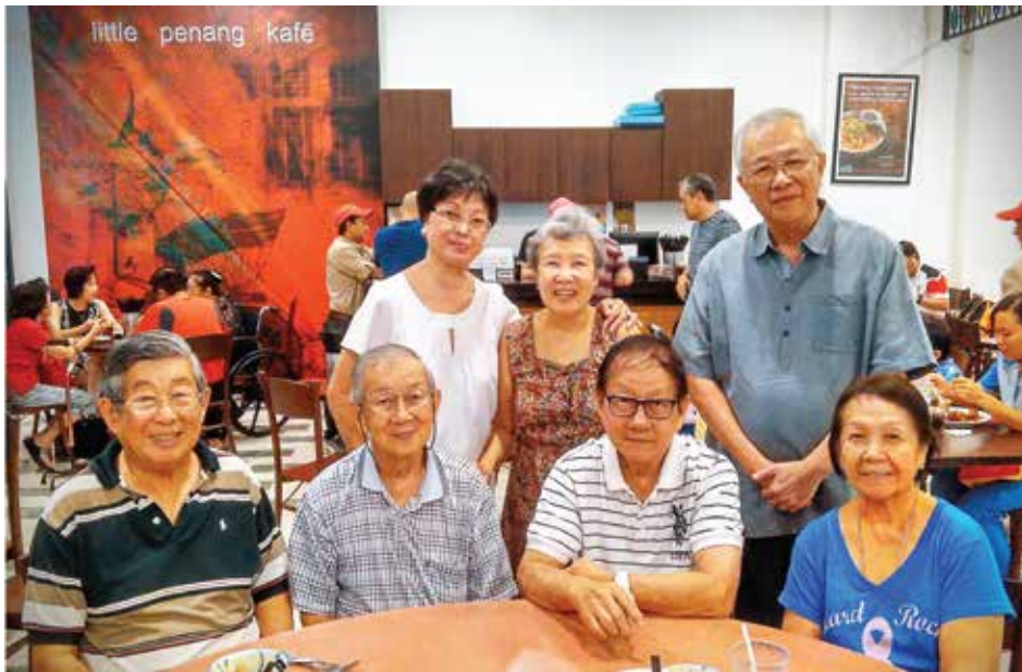
OLD CLASSMATES REUNION