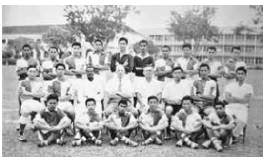
1959 PFS SOCCER TEAM