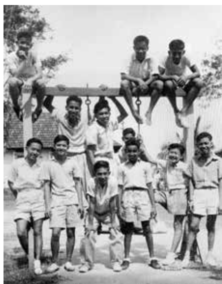
1956 DEC HOLIDAYS, PENANG HILL

The post World War 2 period between the 1950s and 1970s was one when the Penang Free School (PFS) flourished and both its academic and sporting activities epitomised the best schooling culture in the country. The PFS aspired to produce well-balanced individuals and prepared them both physically and mentally to take on challenges in life as they morphed into adults after school. Success and achievements in all sporting, academic and other fields, often by the same students, were celebrated and admired by all in the school and beyond.