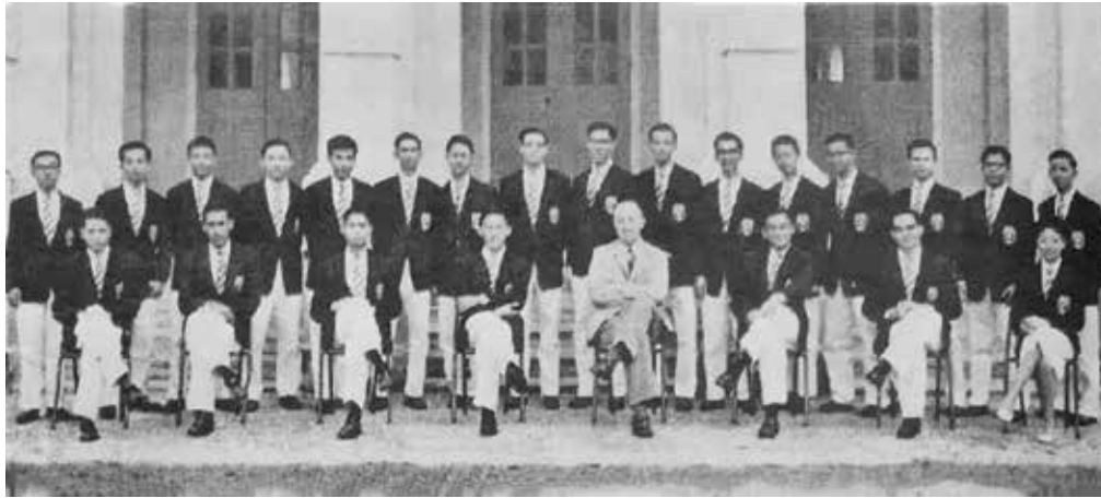
1959 PFS SCHOOL PREFECT BOARD