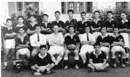
1959 PFS RUGGER TEAM