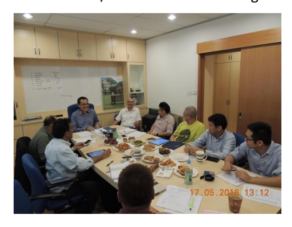
First 2016/18 Committee meeting