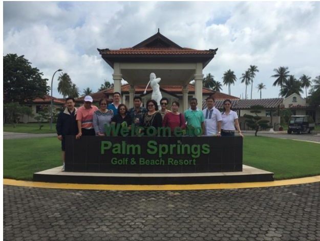
Visit to Palm Springs Golf and Beach Resort