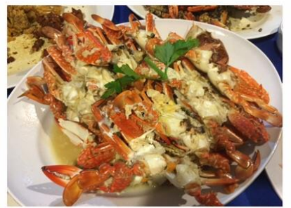
Sumptuous Dinner at Golden Prawn 933