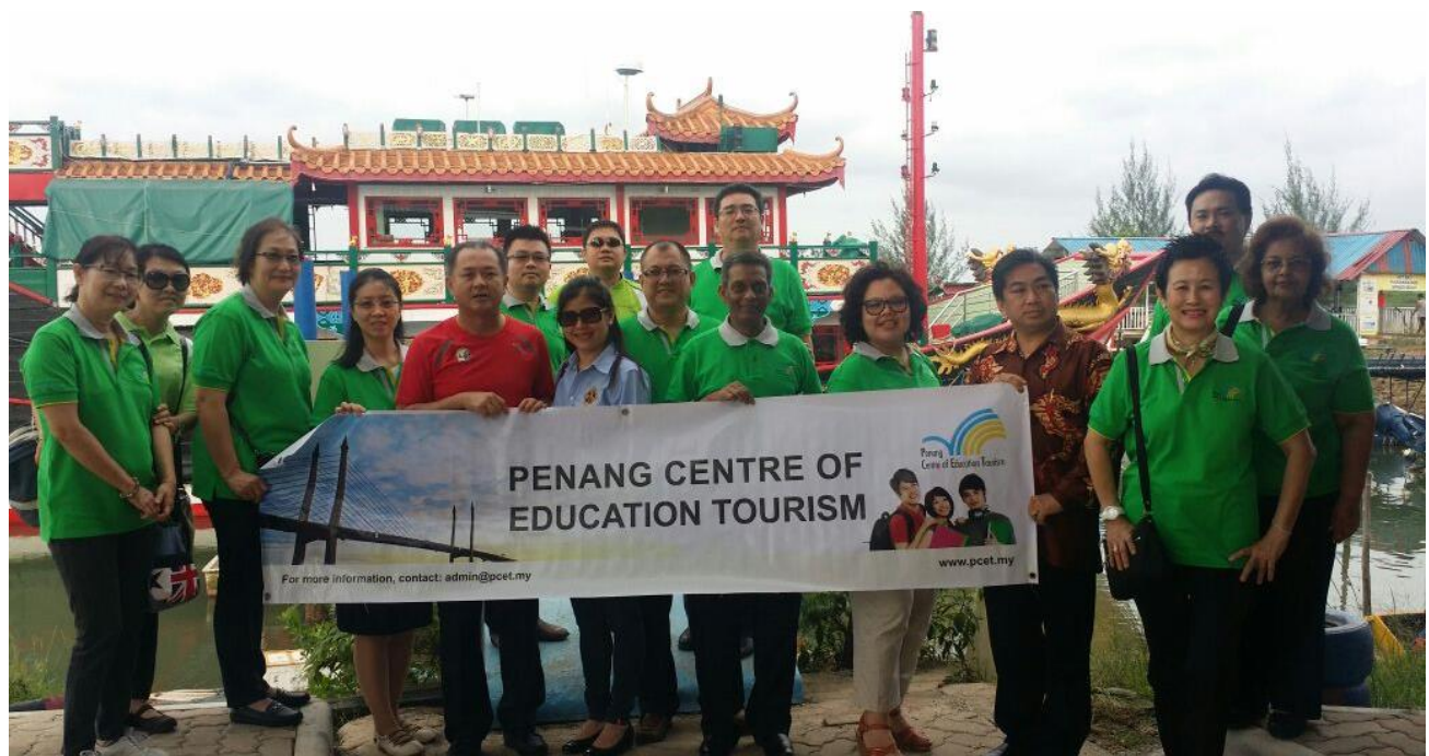
Visit to Zheng Hoe Cruise