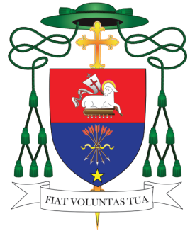
Diocese of Penang